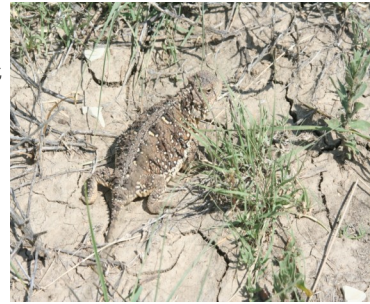
Horned Toad