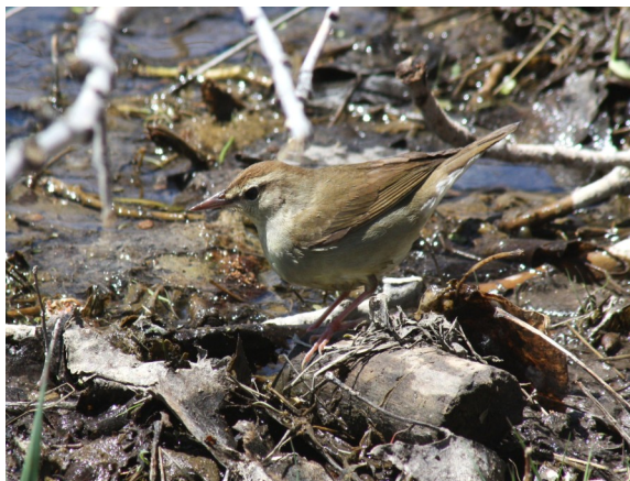
Swainson's Warbler photo by Cole Wild.

tips for where and when to find some of the state's most elusive species, such as Sedge Wren and Black Swift. Most of the birds Cole observed as part of his Colorado Big Year were photographed, and many of his best shots will be displayed. After the presentation, Cole