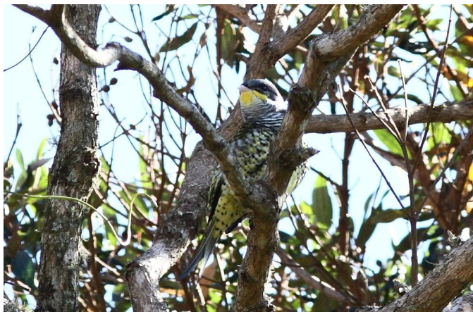
Male Swallow-tailed Cotinga, SE Brazil.