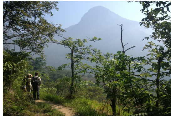
Inspecting prospective property for protection in the Atlantic Forest., Brazil.