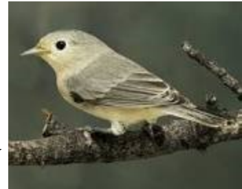
Lucy's Warbler from www.allaboutbirds.org/ .

This bird is also one of only two cavity nesting warblers; it uses mesquite trees or cacti. Grand Isle is a windswept island of sand beaches. The Lucy's Warbler uses old woodpecker nests or other cavities, filled with debris that they build the nest atop. This gives them a clear view of any predator approaching. They also nest in densities of five pairs per acre, which