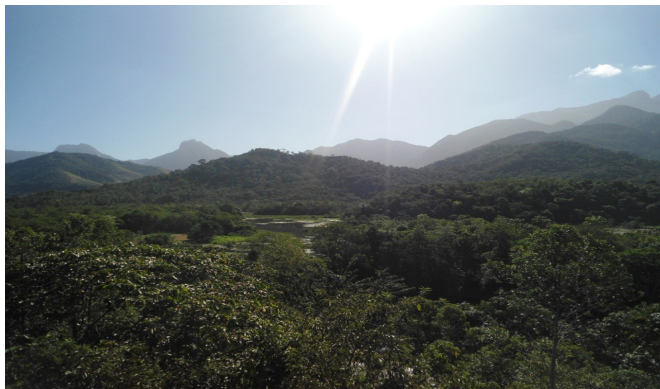
Atlanta Forest of REGUA