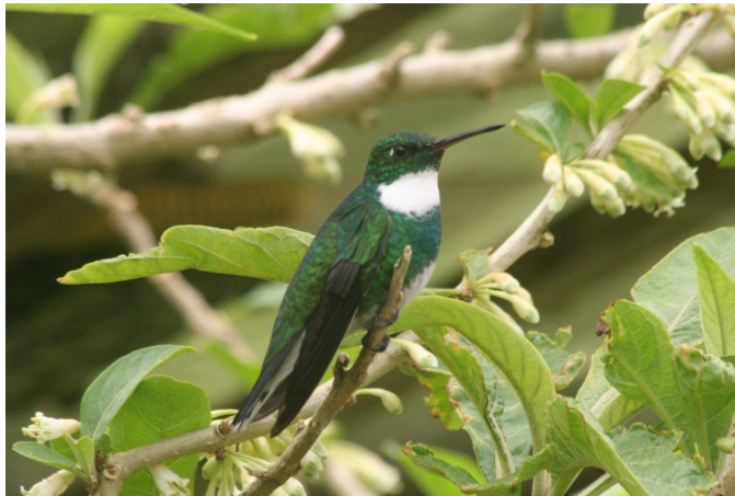
White-throated Hummingbird, SE Brazil.