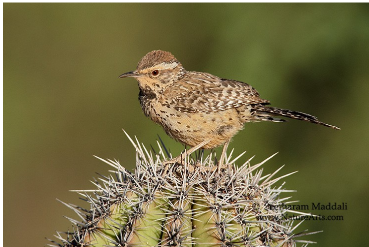
Lucy's Warbler from http://www.blog.naturearts.com/ .

I thought of myself and my translocation from the green, moist land of the Deep South and believe it or not, I missed the seven inches of snow that fell on my Colorado home over Christmas. I hopped my wings on January 2 and it is good to be home—dry climate, snow, and all. I hope that the migrant Lucy's Warbler found its way home also!