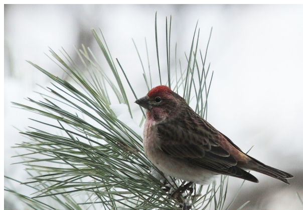
Cassin's Finch by Ron Harden.

Thanks to all who participated! Next up: The Great Backyard Bird Count!