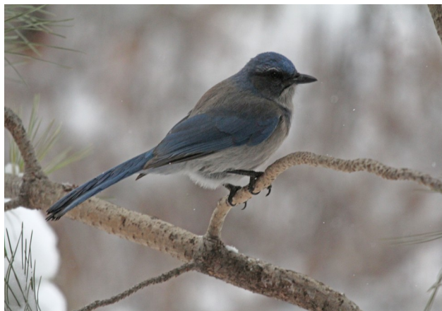
Scrub Jay

The Fort Collins CBC took place on Saturday, Dec. 20, 2014. We wound up with 95 species, an exotic (Chukar), and three count-week species, with a total of 44,120 birds counted. Seventy-five