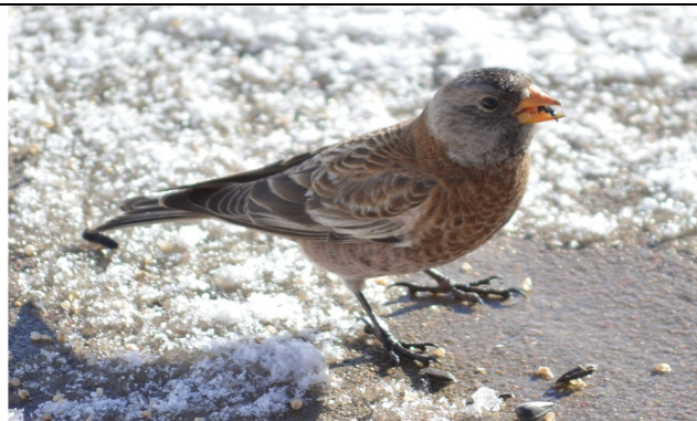
Gray-crowned Rosy-Finch

March 8, Sunday, Bobcat Ridge Natural Area Bird Survey. Meet at 7:30 a.m. See description and contact details above for this recurring, monthly survey.