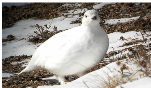
White-tailed Ptarmigan.