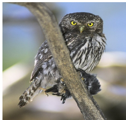
Northern Pygmy-Owl with Red-breasted Nuthatch.