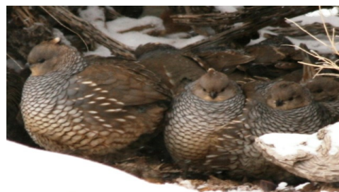
Scaled Quail