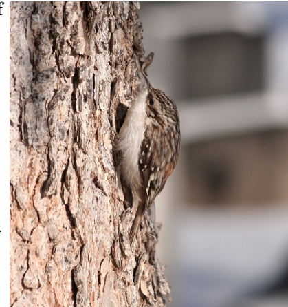
Brown Creeper