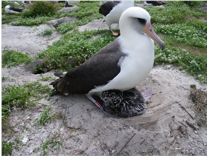
Wisdom—oldest known wild bird.

Wisdom, a Laysan albatross that lives on the Midway Atoll National Wildlife Refuge in the Pacific, northwest of the main Hawaiian island, is 60 years old. Among birds in the wild, albatrosses are believed to be the species that live longest.