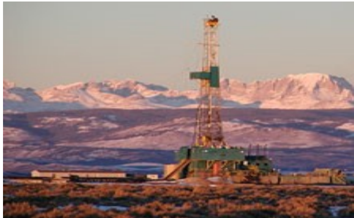
Fracking operation near Rife, Colorado, courtesy of Transition Times.