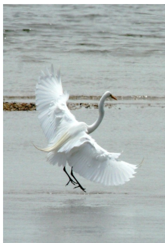
Great Egret