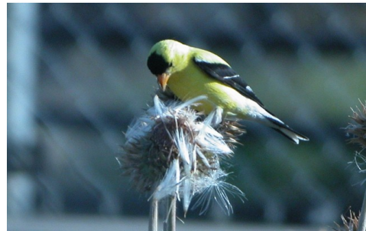
American Goldfinch

Friday and Saturday, May 13 and 14, are the dates of the 2011 Birdathon, an essential fundraiser for FCAS in support of our scholarship program. This annual event is a challenging and