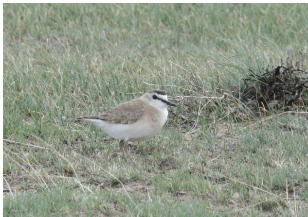
Mountain Plover

Join us on Thursday, April 14 at 7 p.m. in the multi-purpose room of the Fort Collins Senior Center for this opportunity to learn more about the ground-nesting Mountain Plover and efforts to conserve its needed habitat. Come at 7 p.m. to meet and mingle with FCAS members.