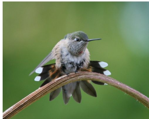
Broadtail Hummingbird

Fort Collins Audubon welcomes new National Audubon Society members by sending complementary copies of our newsletter for three months. We invite you to join us at our monthly programs on the second Thursday of the month to find out more about Fort Collins Audubon. National dues do not cover the cost of printing and mailing the newsletter, so if you'd like to keep receiving the Ptarmigan after the three complementary issues, please join FCAS. See the details on the last page of the newsletter or on our Web site at www.fortnet.org/audubon .