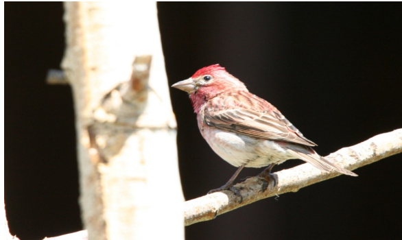
Cassin's Finch

time to develop a clear perspective on the great diversity of life zones that exist in Colorado. And, considering the effects that climate change is having on spring this year, we could see more southern birds creeping north. Check out a fuller description of each month's weekend tours on our Web site at www.fortnet.org/