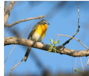
Yellow-breasted Chat.

The Birdathon is Friday and Saturday, May 11 and 12, to be followed with an informal "Beer and Brag" get-together at 6 p.m. on Saturday, at Panhandler's Pizza, 1220 W. Elizabeth Street in Fort Collins. We hope to see you then. BYOP (Buy Your Own Pizza!).