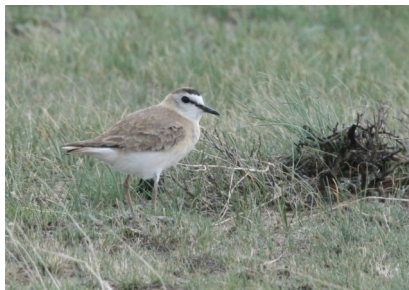
Mountain Plover by Bill Miller .

Migrating passerine birds of the east and west mix together at Great Plains migration hot spots provided by islands of forest habitat among a enormous grass sea. The tour will visit a variety