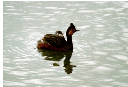
Eared Grebe with Chick