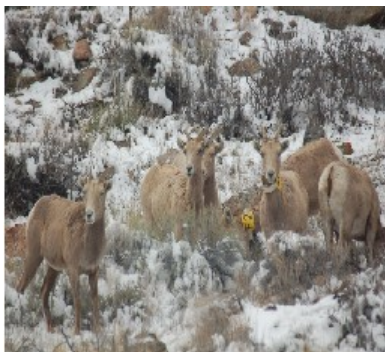
Bighorn Sheep

Join us on May 10 at the Senior Center in Fort Collins. This program is free; the public welcome.