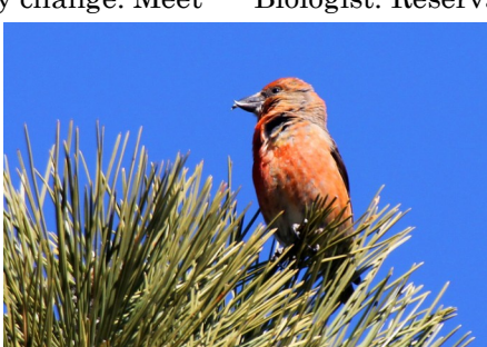
Red Crossbill by Cole Wild.

rorighter@earthlink.net, 303-908-1667. This trip will begin at 8 a.m. at the parking area just past the tollbooth. Note that Gateway is a fee area ($5/vehicle) and consider carpooling. Bring a