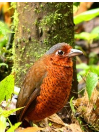
Giant Antippa