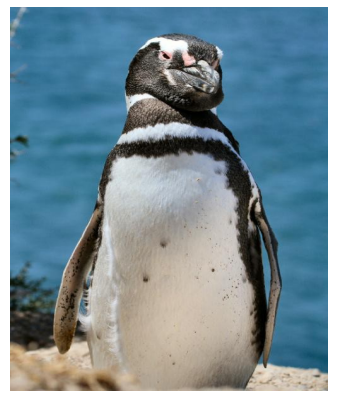
Magellanic Penguin by Rick Harness.

world. In some locations, electrocutions can affect populations. In September 2013, raptor electrocution data was collected from South American biologists on species that included the Chilean Eagle and the endangered Crowned Eagle. A workshop was then held in Patagonia, South America to address common