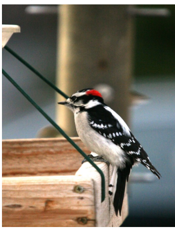
Downy Woodpecker

Those were the highlights. Lots of sun, warmth, moist salty air and then home. So I had to