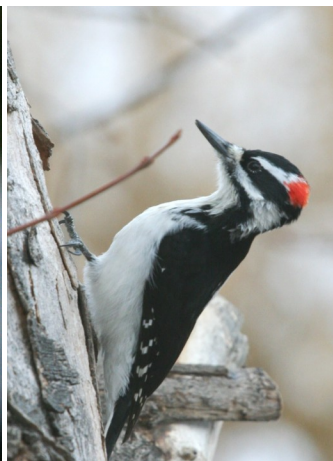
Hairy Woodpecker

I have now put my backpack with binoculars