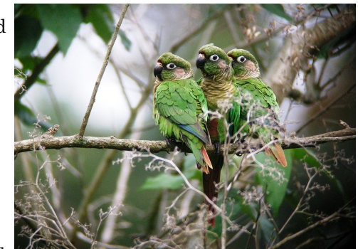
Maroon-bellied Parakeets

to spy Spot-billed Toucanets, Crescent-chested Puffbirds, Slaty Bristlefronts, Pin-tailed and Blue Manakins, the handsome Shrike-like Cotinga, and much more.