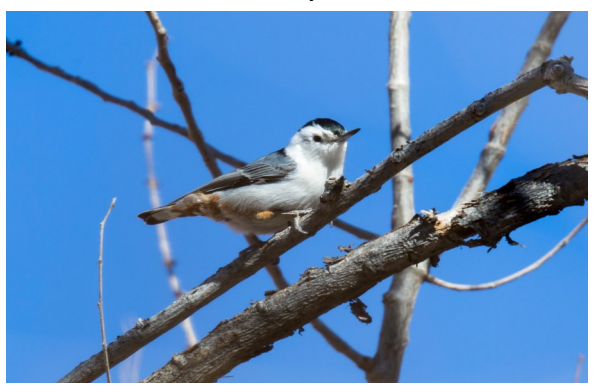
White-breasted Nuthatch.

May 9, Sat., Bobcat Ridge Natural Area Bird Survey. Meet at 7 a.m. See description and above for this recurring, monthly survey.