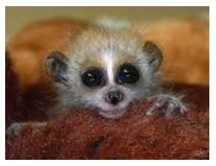
Slow loris

servation efforts. While appealing to the emotional side of conservation issues, there is the hidden danger of causing harm. One recent example involved the <u>slow loris</u>, a small, threatened primate in