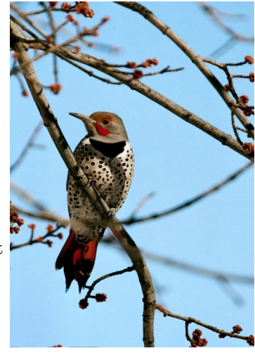
Red-shafted Flicker by Bill Miller.

ing people. What is the shape of the beak? What is the color of the beak? What colors are the legs and feet? And, most important, not just what is or are the colors of the bird, but where are the colors located? In other words, what is the pattern of the color or colors on the bird? And, if I cannot get to species, I can almost always get to genus.