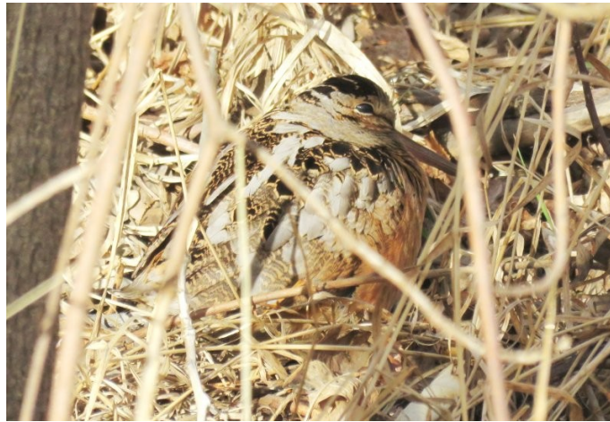
One local rarity shared through social media: the American Woodcock, at Bobcat Ridge.

COBirds is a free email list established in 1995 for the discussion of Colorado birds. COBirds is managed by Colorado Field Ornithologists. People post messages on COBirds by joining a Google group and sending email to the group. The group currently has more than 1,400 members who use COBirds primarily to spread the word on interesting or rare bird observations in Colorado. Anyone can apply to join the group. Best of all, anyone can view the messages posted on COBirds without even becoming a member. You only need to become a member to post your own messages. If you want to check out COBirds, go to the Colorado Field Ornithologists' website at http://cobirds.org/ and follow the link to the COBirds Google Group. You'll be able to find information