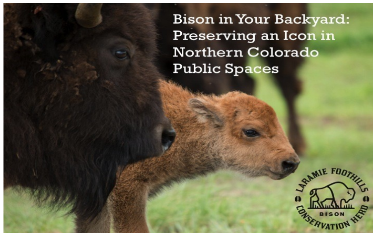
Bison in Your Backyard: Preserving an Icon in Northern Colorado Public Spaces