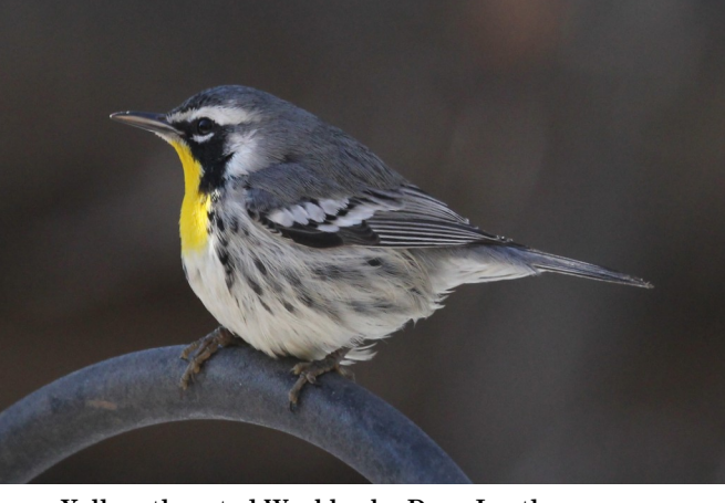
Yellow-throated Warbler by Dave Leatherman.

Horsetooth Reservoir. Yellow-rumped Warblers were seen in several areas, a new high count of that species. Other highlights included a Spotted Sandpiper and four Eastern Bluebirds. In all. 29,000 individual birds were counted, a fairly low number resulting from the minimal number of waterfowl counted.