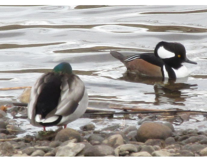
Sleeping male Mallard and male Hooded Merganser by Carole Hossan.

The foliage was austere: muted colors and bare branches. The landscape varied from late autumnal to gritty as there was a short detour due to construction as we reached the edges of