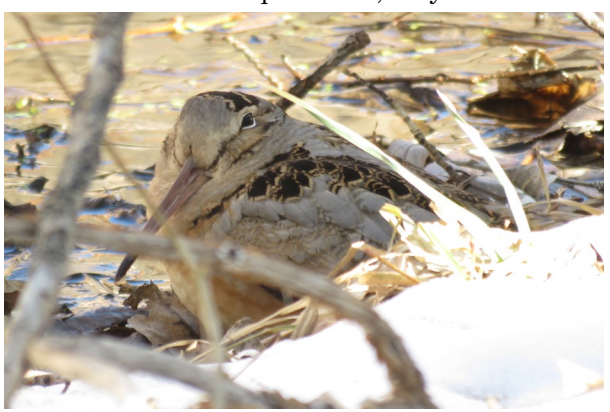
American Woodcock by Nick Komar.

Owl (14), Golden-crowned Kinglet (10), Eastern Bluebird (6), and Song Sparrow (91). In spite of the high species count, overall numbers were actually about average, and waterfowl numbers were generally low, presumably because of the extended cold spell since November. Most lakes were 100% frozen. FCAS thanks the participants and the various organizations that support or sponsor the Loveland CBC: Larimer County Natural Resources Department, City of Loveland