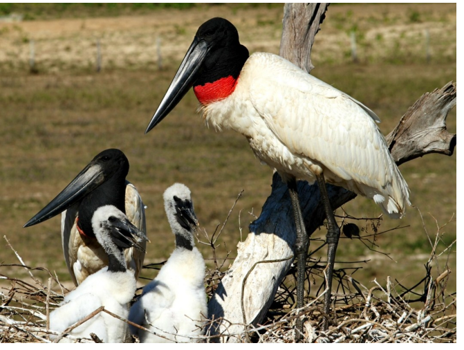
Jabiru with young

Future Bobcat Ridge Natural Area Bird Surveys: See description and contact details above for this recurring, monthly survey. Dates and times for future surveys are