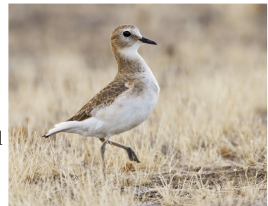
Mountain Plover