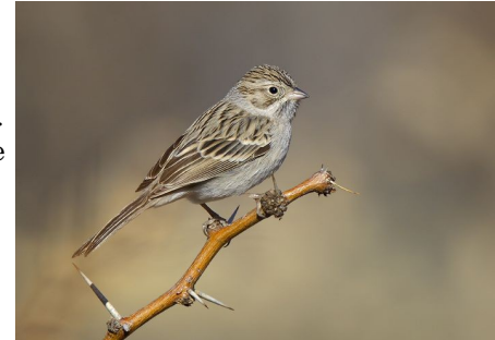
Brewer's Sparrow

Each of those men were, in turn, honored by others who included their names in the common names of, for example, Baird's Sparrow, Lawrence's Goldfinch, and Xantus's Hummingbird.