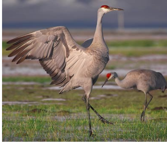
Sandhill Cranes

Spring is just around the corner and with it, one of nature's greatest shows on Earth: spring migration. March—time to spring into birding!