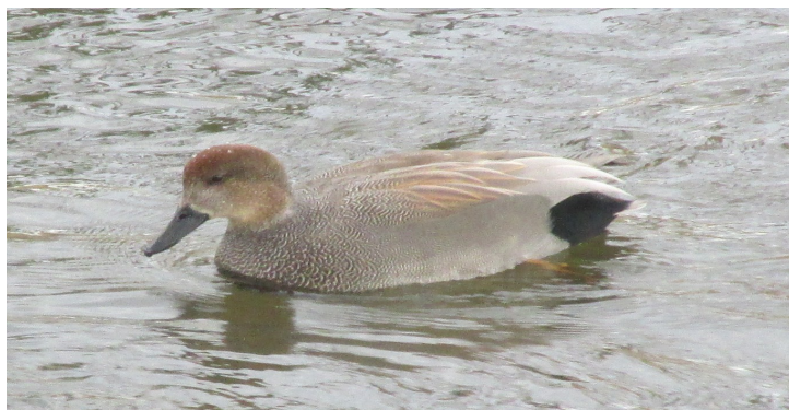
(left) Gadwall on South Platte River

The rest of the seven-page issue contained a species list from Spring Canyon, a segment on recent sightings, a listing of periodical and serial titles at CSU libraries, and a two-page species list for the Fort Collins Bird Club's spring count on Sat., May 16, 1970.