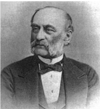
Thomas Mayo Brewer from en.wikipedia.org

In fact, the real story is more interesting and in my opinion more honorable. Common names of bird species that include a person's name are usually a tribute by the discoverer of the species to a loved one, a colleague, an historical figure, or a noteworthy star in the ornithological firmament.