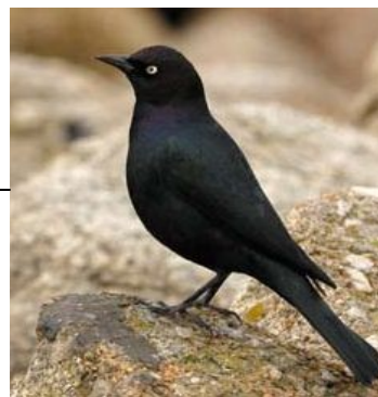
(right) Brewer's Blackbird