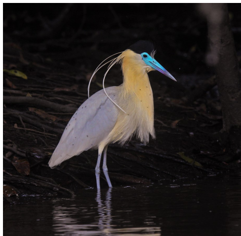
Capped Heron

During the week in the Southern Amazon, participants should encounter around 300 species of birds. The areas visited hold a number of endemic, rare, and local species, among which include Kawall's Parrot, Crimson-bellied Parakeet, Razor-billed Curassow,