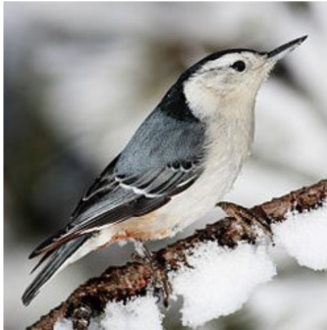
White-breasted Nuthatch

Before roosting, wintering birds must eat, eat, eat. The ability to find ample, quality food is a primary factor in determining a species' winter range. Wintering birds often are seen feeding in flocks as group feeding behavior creates added safety by providing more eyes to scan for predators. Some birds, like White-breasted Nuthatches, cache food for even leaner times.