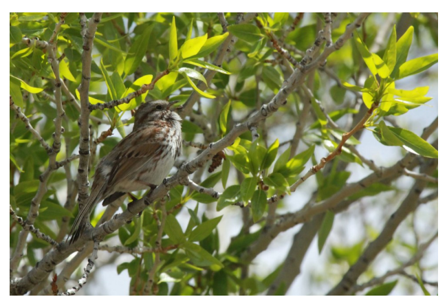
Song Sparrow

Thank you for your membership. Your support makes our programs and conservation efforts possible and helps us achieve our mission of connecting people to the natural world.