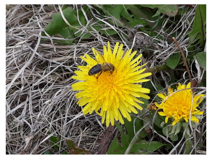
Bee on dandelion by Sheila Webber.

Alpine Dandelion ( Taraxacum ceratophorum ) usually found in high mountain regions is one of several species of dandelion native to North America. Common dandelions, which dominate lower elevations, were introduced by European settlers to grow in gardens for food and medicinal purposes. The benefits of dandelions to humans and wildlife are impressive. The leaves are eaten by wildlife and humans, and are full of nutrients such as vitamins K and A. The root can be used to make tea and even a coffee substitute. The flowers are edible as well. Use them as a desert garnish, or to make dandelion wine. There are a slew of websites you can visit to get information on how to use this amazing