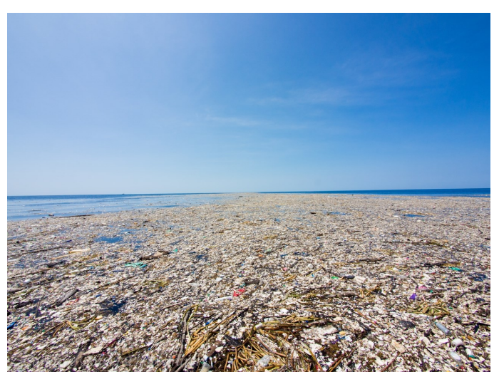
The Great Pacific Garbage Patch from https://www.reddit.com.

and not allow cities to do less than statewide standards. before it reaches the oceans (https:// Persistence and demand by citizens for action are the