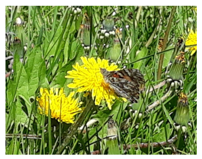
Painted Lady on dandelion

I think back to last April when arriving home from work, I witnessed a dozen Painted Ladies flitting around the dandelions sprinkled throughout the yard.