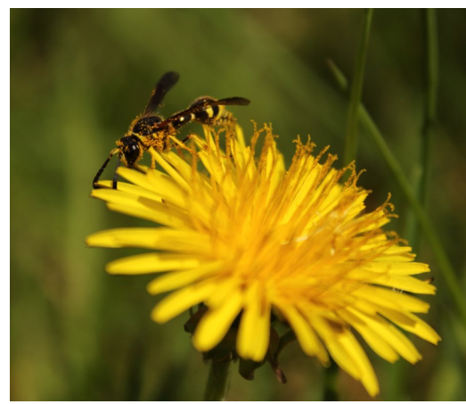
Mason Wasp on dandelion

Another morning that same month, my husband pointed out a Painted Lady that had been perched on a dandelion for over fifteen minutes. Since an early frost killed the flowers on our crab apple tree, I am grateful that these early-blooming dandelions provided food for these beautiful insects. I have seen at least seven species of bees, five beetle species, and many other insects on the dandelion flowers. When they go to seed, finches love to eat them. Hummingbirds will use dandelion fluff to line their nests.