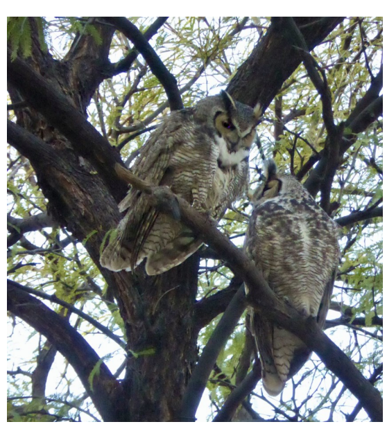
Great-horned Owls in Oro Valley, AZ.