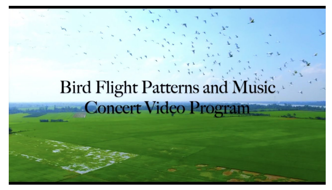
From <a href="https://nbsymphony.org/">https://nbsymphony.org/</a>

tra, to our members. This is a virtual concert program that explores five bird flight patterns alongside performances of classical music that move in the same shape and motion of each flight pattern. There is an article in the spring edition of Audubon magazine featuring this program. If you are interested in viewing this unique and interesting program, please message us on Instagram (<u>https://www.instagram.com/fcaudubon</u>) or email Sheila Webber at <u>mailto:13sheilaw@gmail.com</u>.